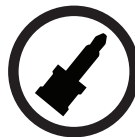
Mini Jack to Toslink Adaptor